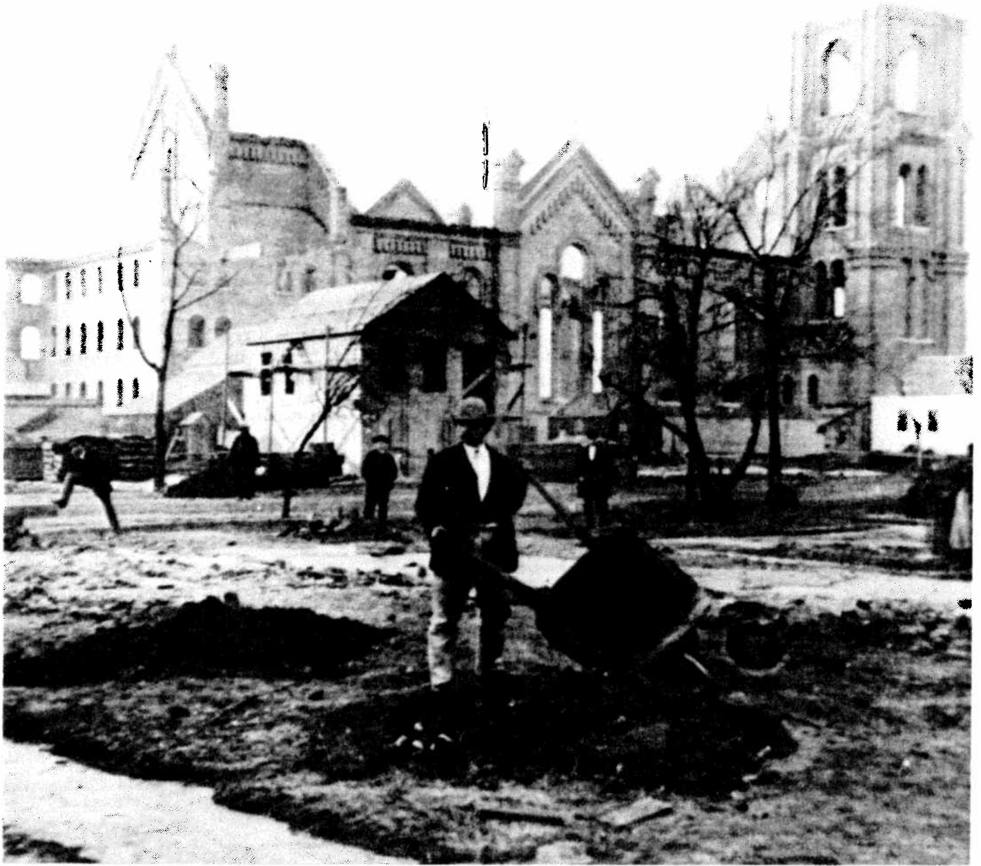
This photograph, taken shortly after the Chicago Fire of 1871, shows the ruins of St. Michael's Church. The double walls on the south, east, and west ends of the church withstood the fire. Within one year and three days after the fire, the industrious parishioners of St. Michael's Church rebuilt the damaged structure. Chicago cottages like the one pictured in the center of the photograph dotted the area within days after the fire and were sometimes referred to as "relief shanties."